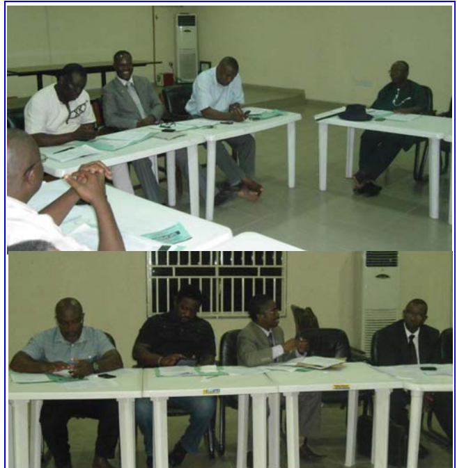
NSE PH EXCO meeting held on Thursday 3rd October 2013