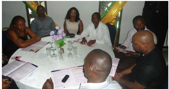
Members of the Apenu family